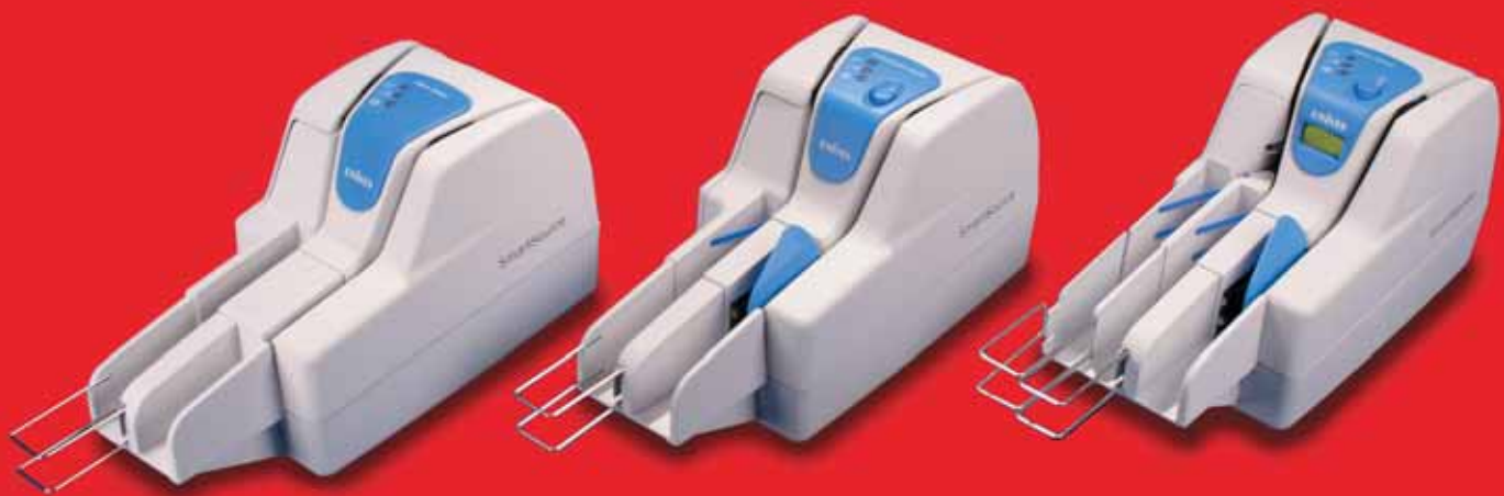
SmartSource Value series